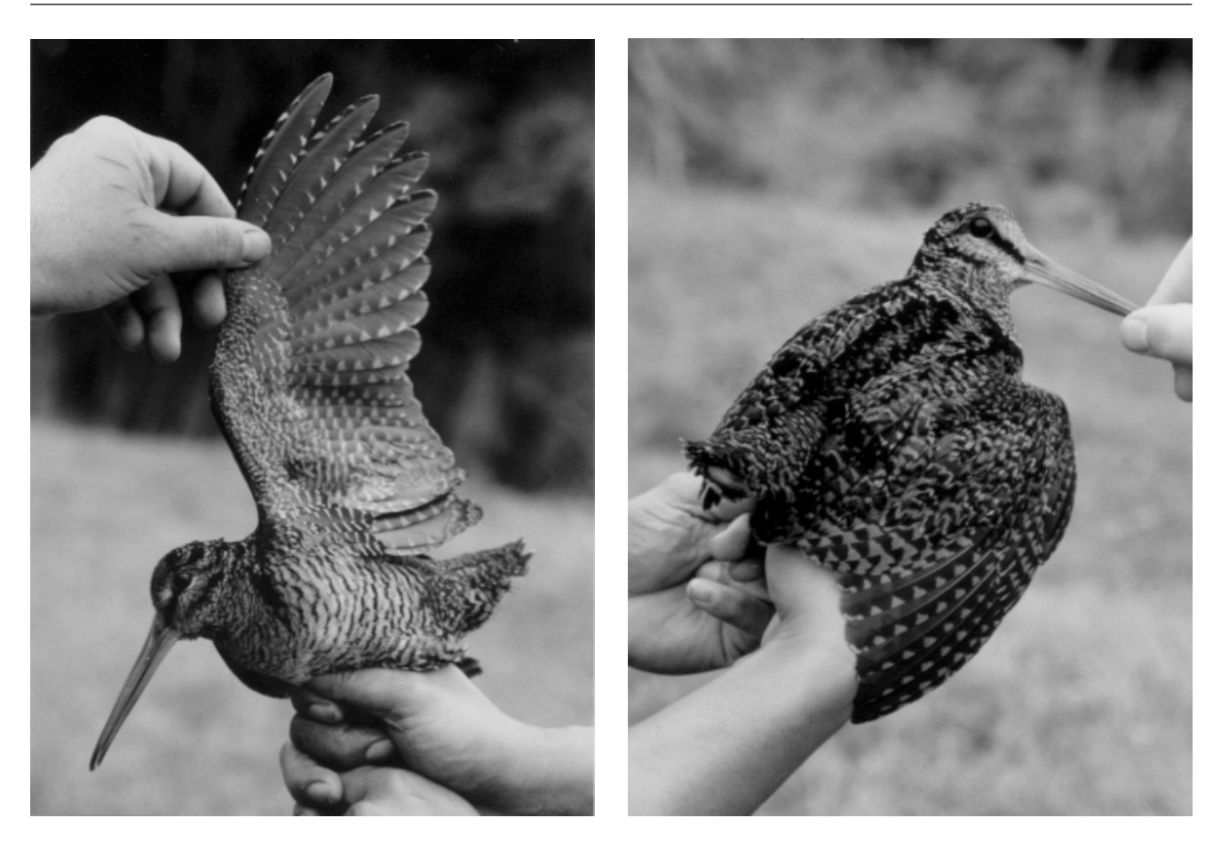
Figure 2. The holotype of Scolopax bukidnonensis shortly after it was captured on Mt. Kitanglad.