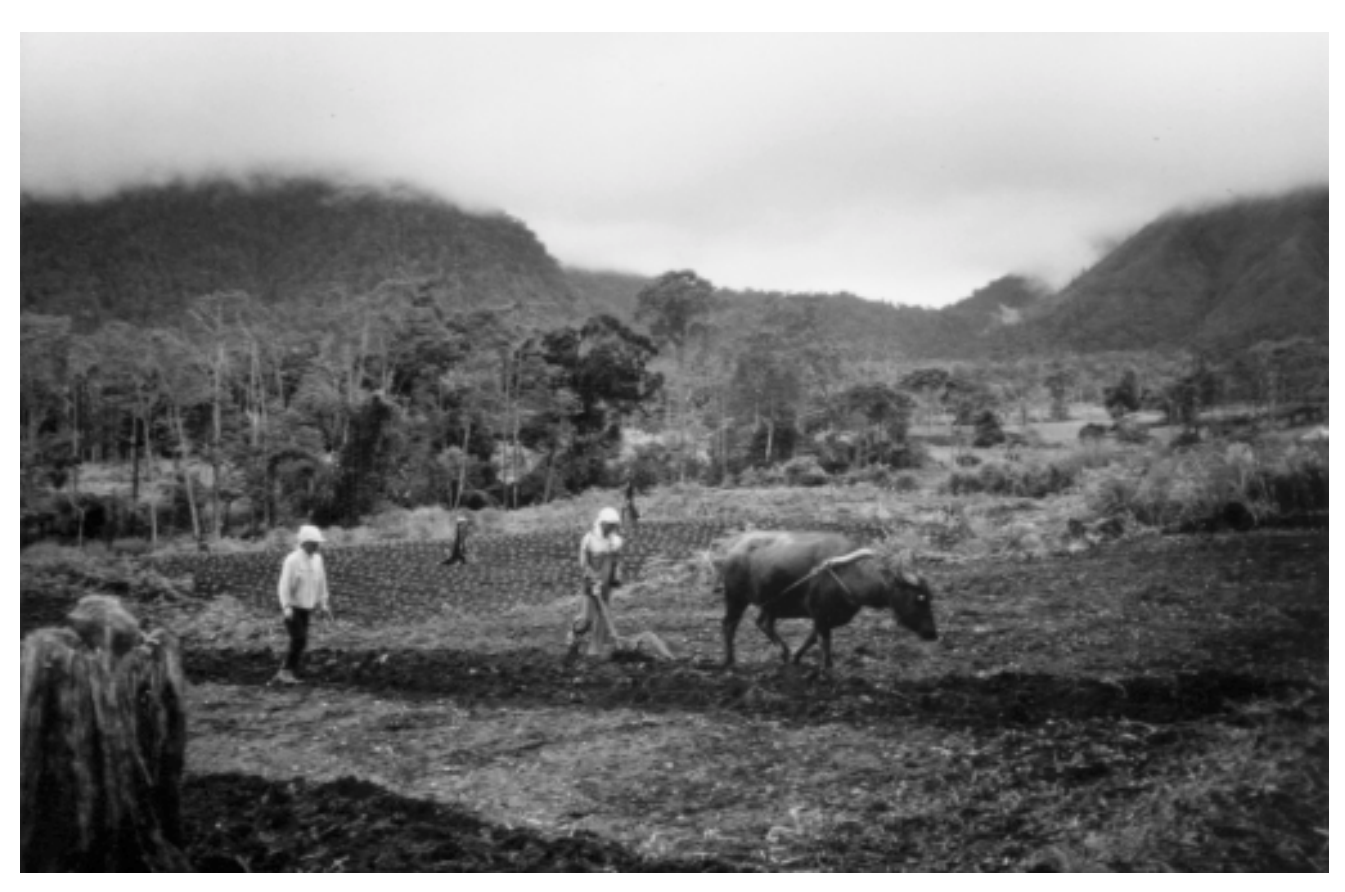
Figure 3. The type locality of Scolopax bukidnonensis on Mt. Kitanglad on 22 January 1995, the day the holotype was captured.